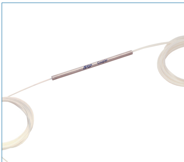
Standard and Mini C and L Band Singlemode Fused Coupler