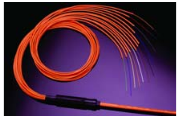
Fan-Out Cable Assembly | Photo TOPPS1028