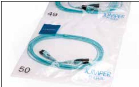
Self-tracking inventory count on each bag