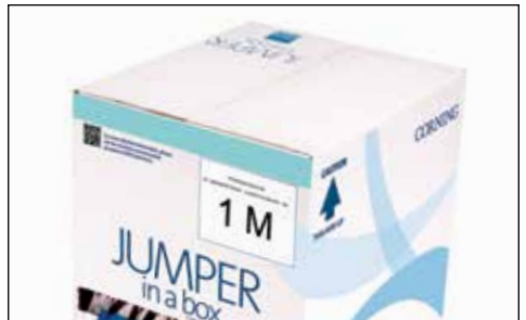
Colored bar indicating single-mode or multimode