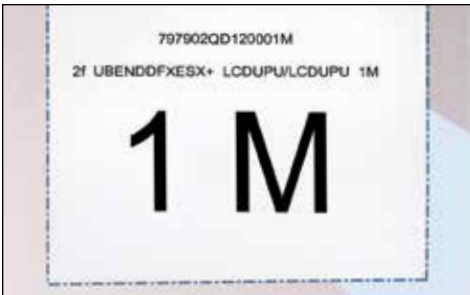
Part number identification at a glance